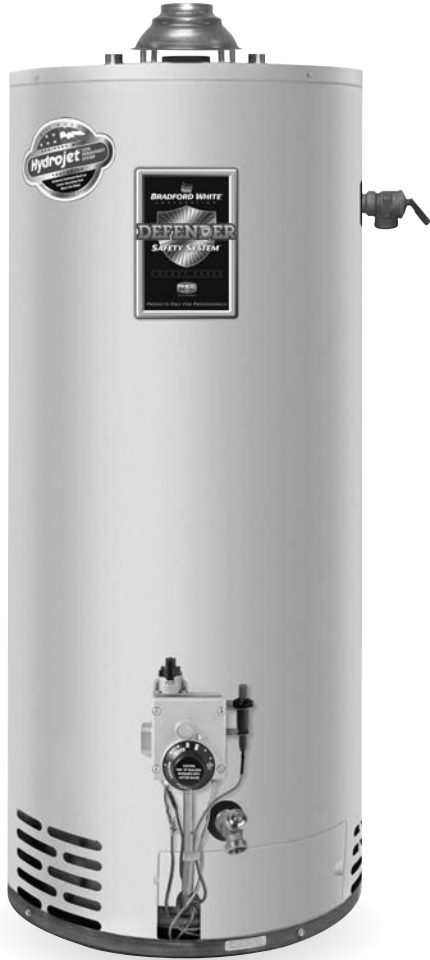
Photo is of M-I-5036FBN