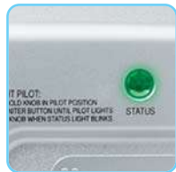
Gas Control Valve with Exclusive GREEN LED Indicator