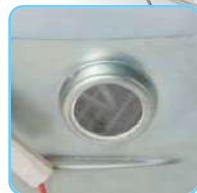
Sight Window to Combustion Chamber