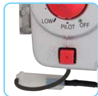
Integrated Piezo Igniter