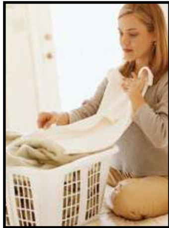
In the laundry . . .