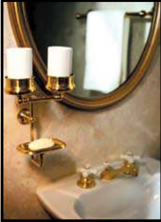
In the bathroom . . .

Enjoy Softened Water Throughout Your Home