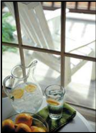
In the kitchen . . .

Economical Water Conditioning System SAVES You Money!