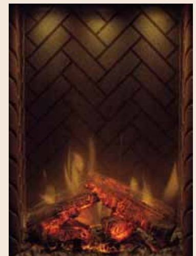
Herringbone Brick Interior