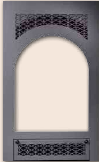
Victorian Lace TM Face

The delicate Victorian Lace face design features woven grill work in a charcoal paint finish.