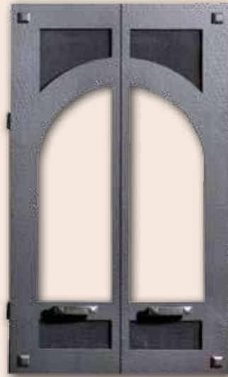
Bungalow TM Face

The Bungalow TM double door face design features a charcoal powder coated textured surface.