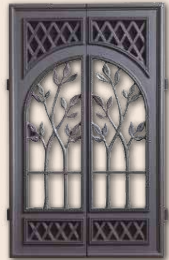
Tree of Life TM Face

The organic Tree of Life double door face design features cast iron charcoal paint finish