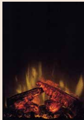
Standard Black Interior

The interior of the Hideaway E comes in standard black. You have the option of upgrading the interior with the Herringbone Brick liner. The interior liner comes with two side pieces and one-way glass to add a great amount of character and depth to the fireplace! Use the remote control to adjust the intensity of the downward shining LED accent lights to control the amount of interior lighting that you desire for your fireplace!